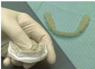
Orthotics stabilized the bite

The letters "TMD" stand for temporomandibular dysfunction. This refers to problems with the muscles and joints that join the mandible bone of the jaw to the temporal bone at the base of the skull.